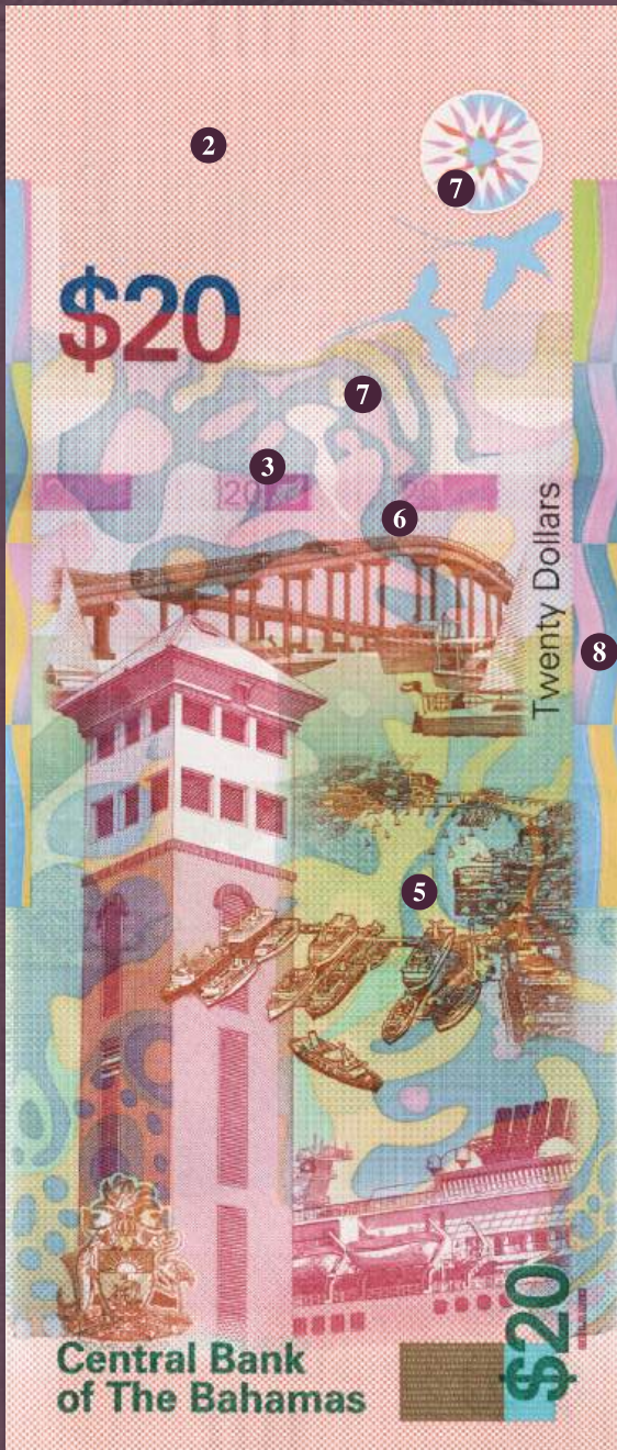
Back of note