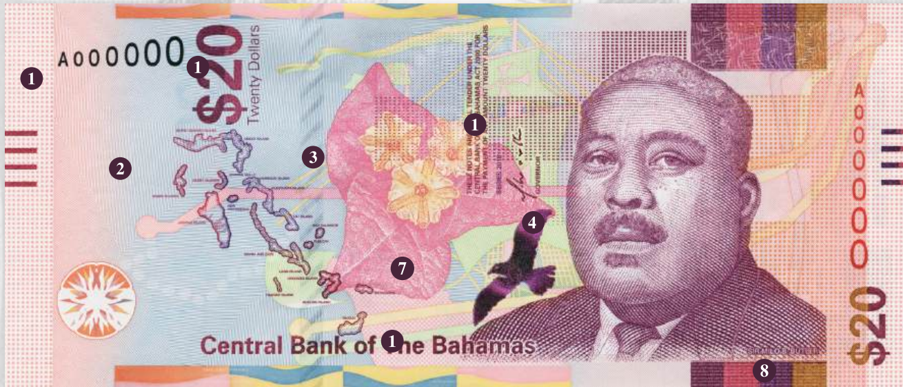
Front of note

A new $20 banknote has been introduced and it is important that you know what to look for to check that a note is real