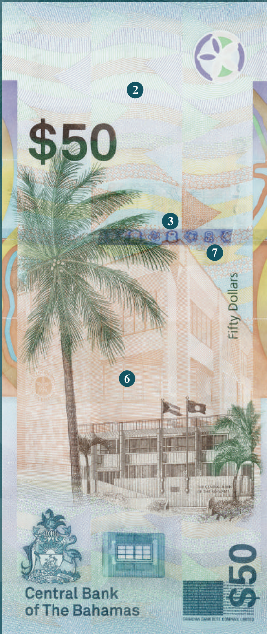
Back of note