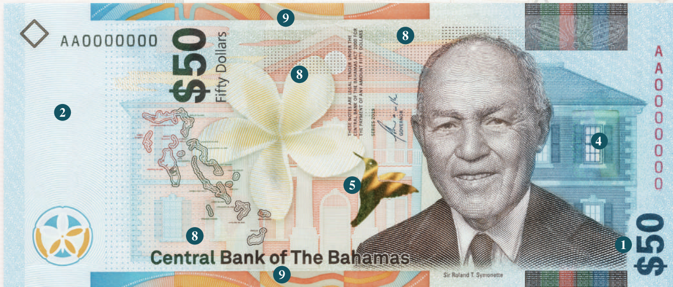
Front of note

A new $50 banknote has been introduced and it is important that you know what to look for to verify whether a note is genuine or not.